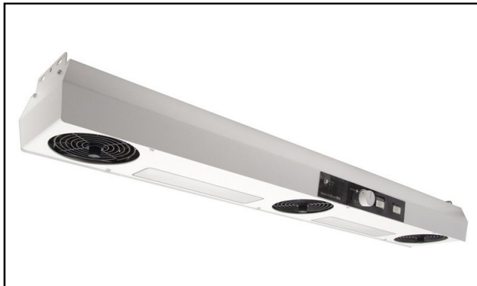
Figure 1. SCS 991A