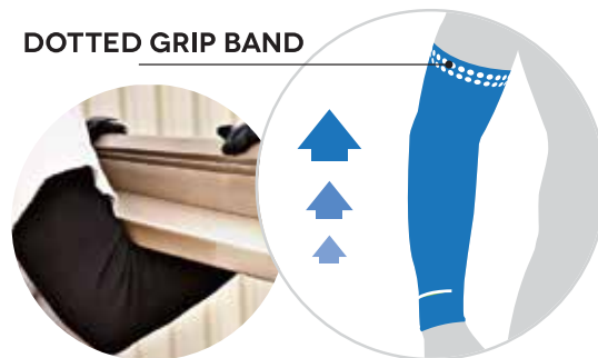
DOTTED GRIP BAND

No more slipping! Sleeves with arm openings featuring "STAYz-Up" technology hold up—comfortably gripping onto underlying fabric or skin to ensure sleeves stay in place, and keep you protected no matter what. Unlike other products on the market, we won't let you down.