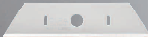
SKB-2S (cutting depth 0.61"/15.5mm)

For cleaning and blade change instructions see: www.olfa.com/SK14