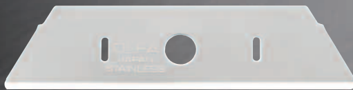
SKB-2S-R/10B (cutting depth 0.56"/14.5mm)